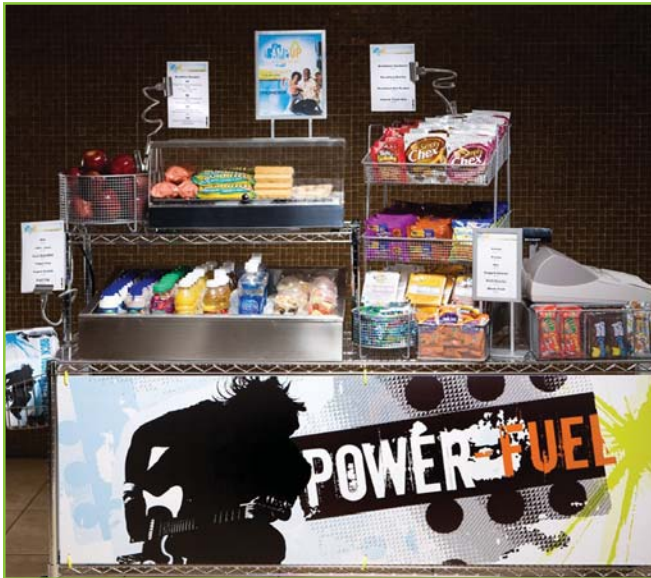
Trenton Public Schools

New and different food options is critical to keep students engaged and excited about school dining. ARAMARK created monthly food-focused promotions making school meals appealing to elementary students. The point-of-sale materials are designed with fun graphics to engage Trenton students and reinforce the importance of a healthy school lunch or breakfast to younger customers.